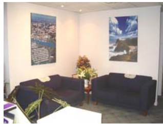
Spacious, Modern Facilities

Solomon Group is a Maori Private Training Establishment/Tertiary Education Organisation (TEO), which specialises in the provision of