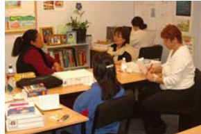
Learn in a supportive environment

Based on Individual preferences the course can also include: