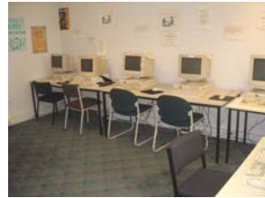
Computers with “Jetstream” internet