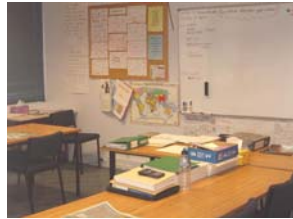
Professional learning environment

“Committed to the Educational development of the individual”