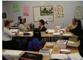
Work with people from different cultures